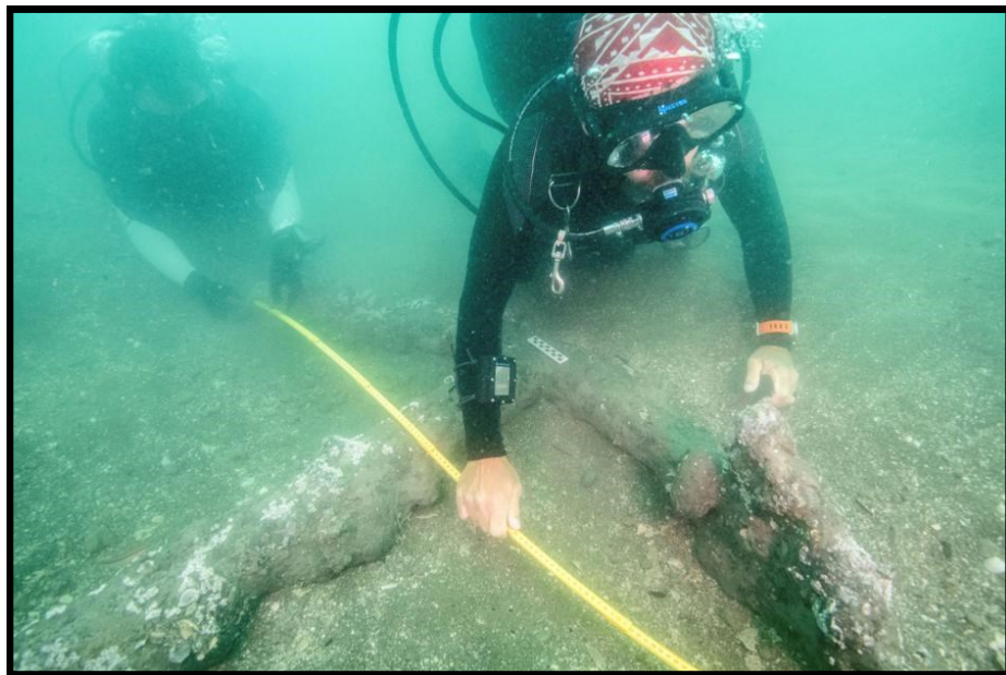
Recovering a 16th-Century Spanish Anchor off Mexico.